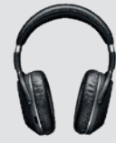
MB 660 UC